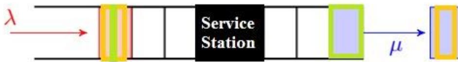
Figure I: Basic application of queue