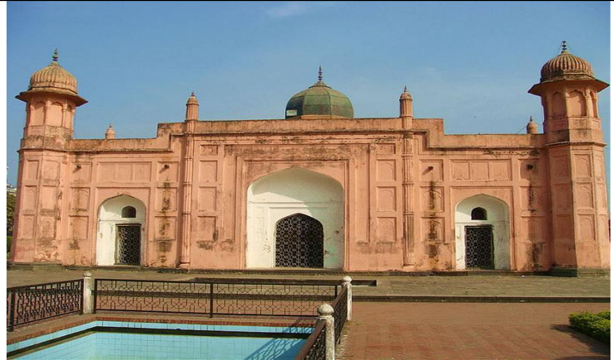
Photo 3 : Tomb of Pari Bibi, Dhaka.