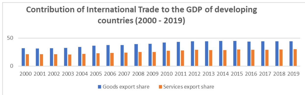
Figure 2. Showing the contribution of international trade to the economies of developing countries from 2000 - 2019

Further analysis was conducted using the data obtained from the United Nations Conference on Trade and Development (UNCTAD) which shows the contribution of international trade to developing (African) countries. This is to show the graphical representation of the data used for ease understanding for the period between 2000 and 2019. A 15-year forecast was equally conducted that covers the period of 200 to 2035.