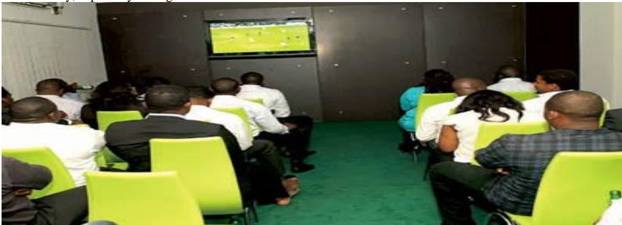
Figure 5: A Football viewing center in Nigeria

The person dabbling into the business is expected to have interest in sports. No need of going for any training before setting up the business. The person starting the job may require the services of a sales person, who will be collecting money and issuing out tickets. According to Babatope (2017) the start up cost is N200,000, N500,000 to N700,000 depending on the scale of the football viewing center business to be operated. The estimated earning is N70,000 above monthly, especially during football season.