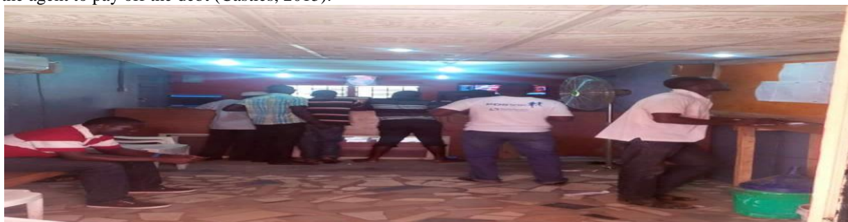
Sport Betting Shop in Nigeria

According to MRPEPE.COM ( n.d.), the start up cost is estimated at ₦956,000. This is a worst-case scenario budget. In terms of remuneration, the owner of the Café is entitled to 50% of profit (profit means total stakes minus total wins); however in a situation where the total wins are more than total stakes, the betting platform will send money to the agent to pay off the debt (Castles, 2015).